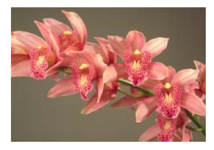
Award photos of multiflora orchids should include enough of the inflorescence to show the arrangement of the flowers.