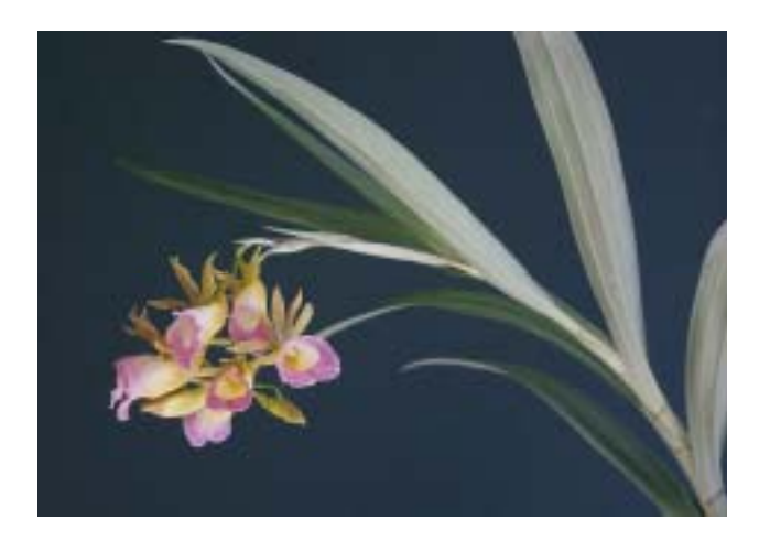
Botanical award photos , CBR and CHM, should show enough of the plant to clearly illustrate the qualities for which the award was given.