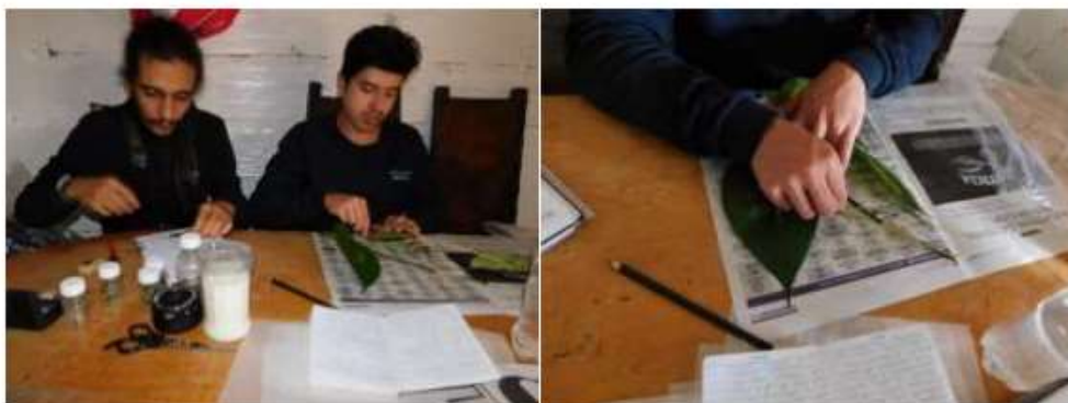
Figure 2. Herbalization of orchid specimens in the Guanacas reserve.