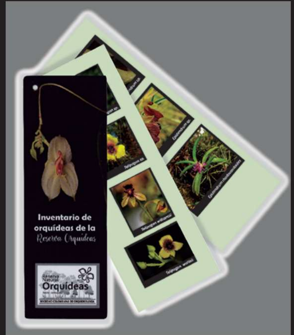
Field guides for use in environmental education and tourism at La Reserva Orquídeas