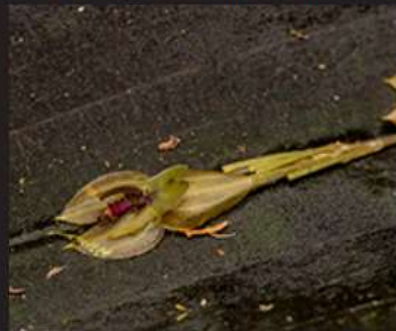
Lepanthes sp. New species