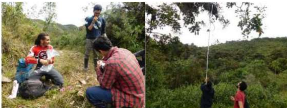
Figure 1. Collection of orchid specimens in the Guanacas reserve.

RESULTS: Identification of 50 morphospecies distributed in 15 genera (Table 1), are reported on a preliminary basis. The best represented genera were in their order: Epidendrum (14 species), Pleurothallis (8 species), Stelis (5 species) and Mesaspiza (5 species).