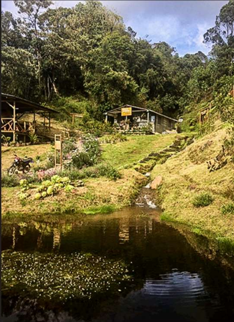
PROGRESS REPORT 2019 GRANT AMERICAN ORCHID SOCIETY LA RESERVA ORQUIDEAS