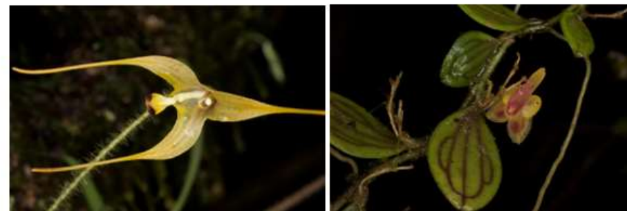
Figure 5. Orchids of the Guanacas reserve. Porroglossum muscosum (left); Andinia hipocreppica (right).