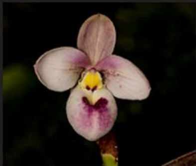
Phragmipedium schlimii (Linden) Braem