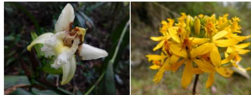
Figure 3. Orchids of the Guanacas reserve. Sobralia sp. (left); Epidendrum aura-usecheae (right).