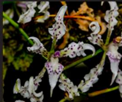
Odontoglossum ramosissimum Lindl.