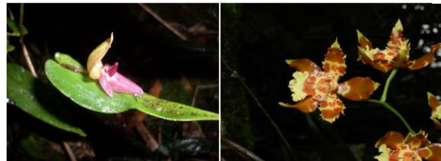
Figure 4. Orchids of the Guanacas reserve. Pleurothallis megalorhina (left); Odontoglossum sceptrum (right).