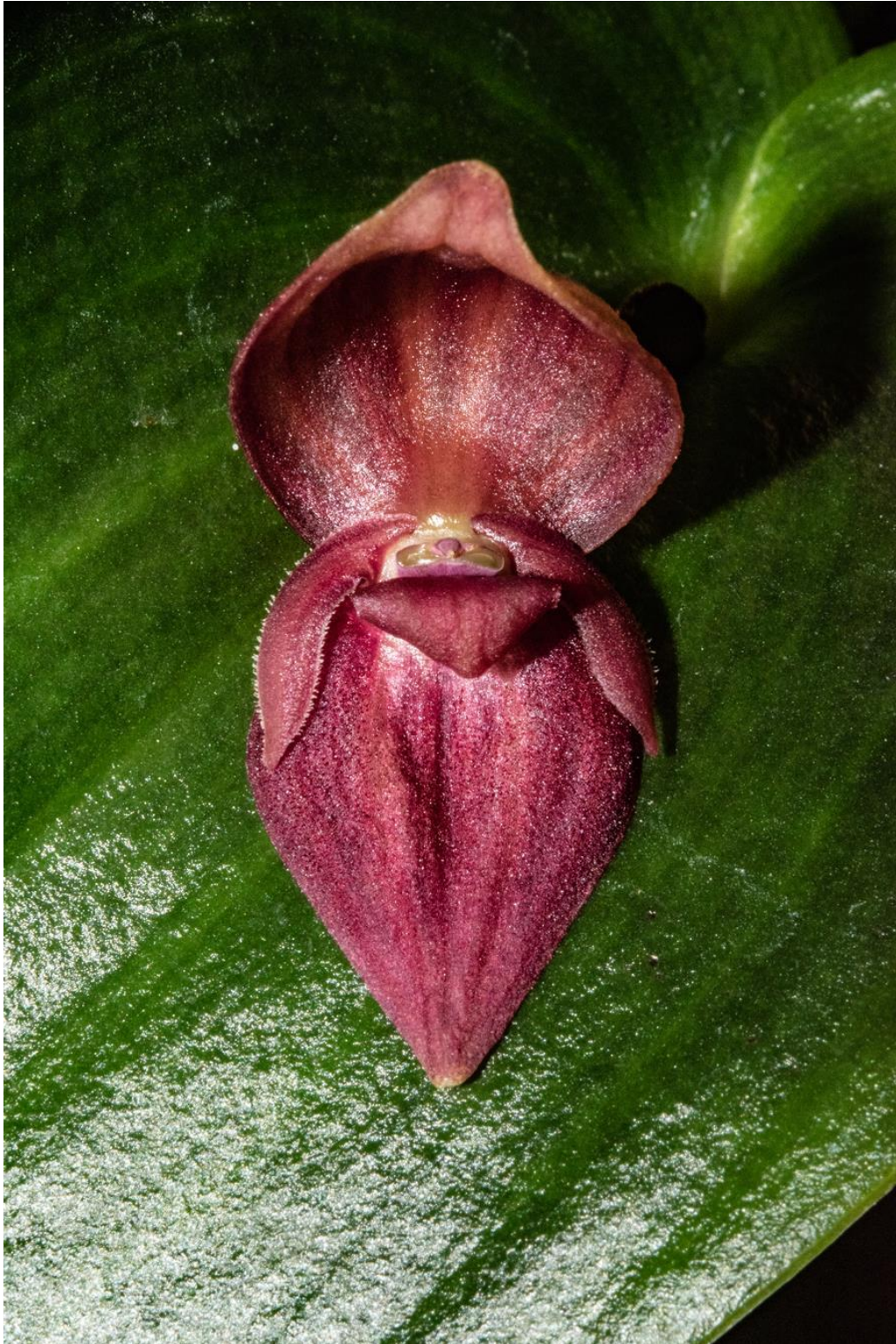
Pleurothallis Memoria Carlyle Luer 'Bryon' HCC | AOS (78 points)

Pleurothallis teaguei x Pleurothallis bivalvis